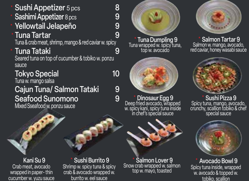
Sushi Appetizer 5 pcs 8, Sashimi Appetizer 8 pcs 9, Yellowtail Jalapeño 9, Tuna Tartar 9, Tuna & crab meat, shrimp, mango & red caviar w. spicy sauce, Tuna Tatakai 9, Searched tuna on top of cucumber & tobiko w. ponzu sauce, Tokyo Special 10, Tuna w. mango salsa, Cajun Tuna/ Salmon Tatakai 9, Seafood Sunomono 9, Mixed Sseafood w. ponzu sauce, Kani Su 9, Crab meat, avocado wrapped in paper- thin cucumber w. yuzu sauce, Sushi Burrito 9, Shrimp w. spicy tuna & spicy crab & avocado wrapped w. burrito w. eel sauce, Salmon Lover 9, Snow crab wrapped w. salmon top w. mayo, toasted, Avocado Bowl 9, Spicy tuna inside, wrapped w. avocado & topped w. tobiko, scallion