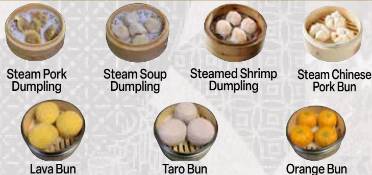
Steam Pork Dumpling, Steam Soup Dumpling, Steamed Shrimp Dumpling, Steam Chinese Pork Bun, Lava Bun, Taro Bun, Orange Bun