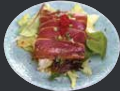
Pepper Tuna Avocado Salad