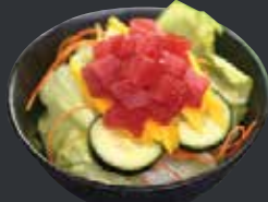
Tuna Mango Avocado Salad