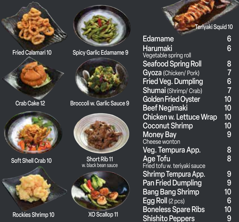
Teriyaki Squid 10, Edamame 6, Harumaki 6, Vegetable spring roll, Seafood Spring Roll 8, Gyoza (Chicken/ Pork) 7, Fried Veg. Dumpling 6, Shumai (Shrimp/ Crab) 7, Golden Fried Oyster 10, Beef Negimaki 10, Chicken w. Lettuce Wrap 10, Coconut Shrimp 10, Money Bay 9, Cheese wonton, Veg. Tempura App. 8, Age Tofu 8, Fried tofu w. teriyaki sauce, Shrimp Tempura App. 9, Pan Fried Dumpling 9, Bang Bang Shrimp 10, Egg Roll (2 pcs) 6, Boneless Spare Ribs 10, Shishito Peppers 9